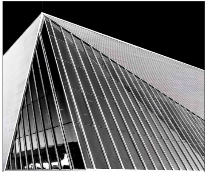
This month we are featuring more top-scoring images from Evaluation #4. Watch for Annual Awards photos in the September edition. This dramatic architectural image is of the Ottawa Aviation Museum, by Gerda Wolker .

https://www.facebook.com/niagaraparks/videos/479669933069064