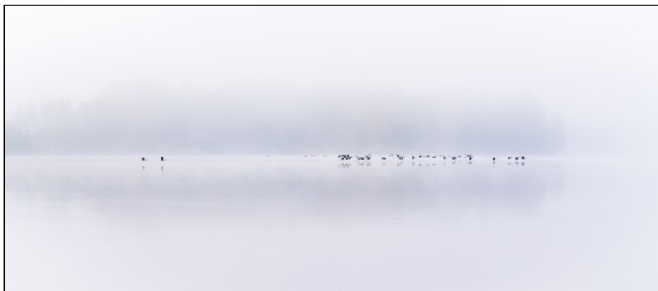
Another high-scoring image from Evaluation #2, Swan Lake by Micheline Godbout .