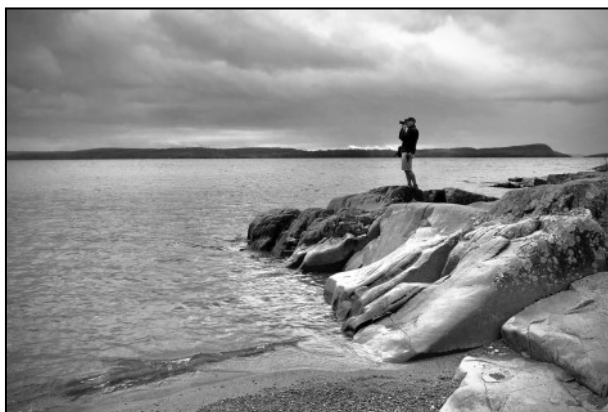
James exploring the shore of Lake Superior.

So, if you're like me and see dark clouds rolling in with the arrival of September, check out what's on offer. I think you'll find the sun starting to peak through!