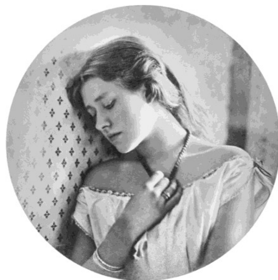
Ellen Terry at Age Sixteen by Julia Margaret Cameron, 1864

Unless otherwise noted, all images in this column are © the photographer or their estate.