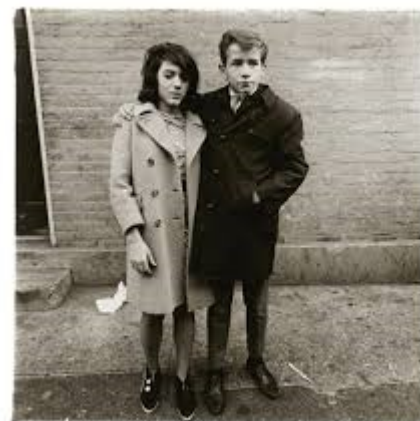
Teenage Couple on Hudson St., NYC by Diane Arbus

Currently the AGO offers a special $35 annual pass , that allows full access to the gallery including exhibitions that otherwise involve an additional charge. This is a great way to get acquainted with the gallery and its offerings.