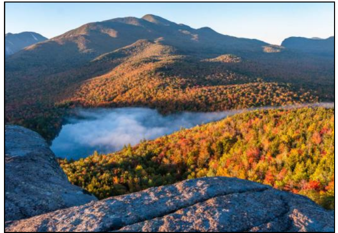
Heart Lake from Mount Joe

Although we still have lots of snow and the temperatures are a reminder that winter is still here, we need to start to look at our programmes for the next year. If you have any suggestions for changes or additions please contact either me or one of the Board members. We also like to hear about things that you think we do well.