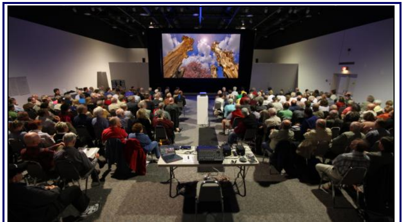
The Latow Audio-Visual Festival draws large audiences from Southern Ontario and Northern New York State.

All shows submitted will be evaluated for artistic as well as technical quality. Ultimately there are many factors that will go into the final selection such as photography, how the images and soundtrack work