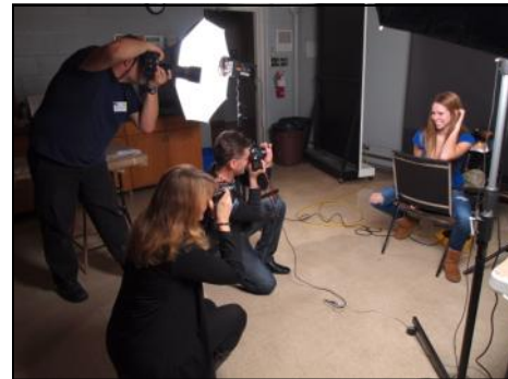
Latow photographers practice their paparazzi portrait skills.