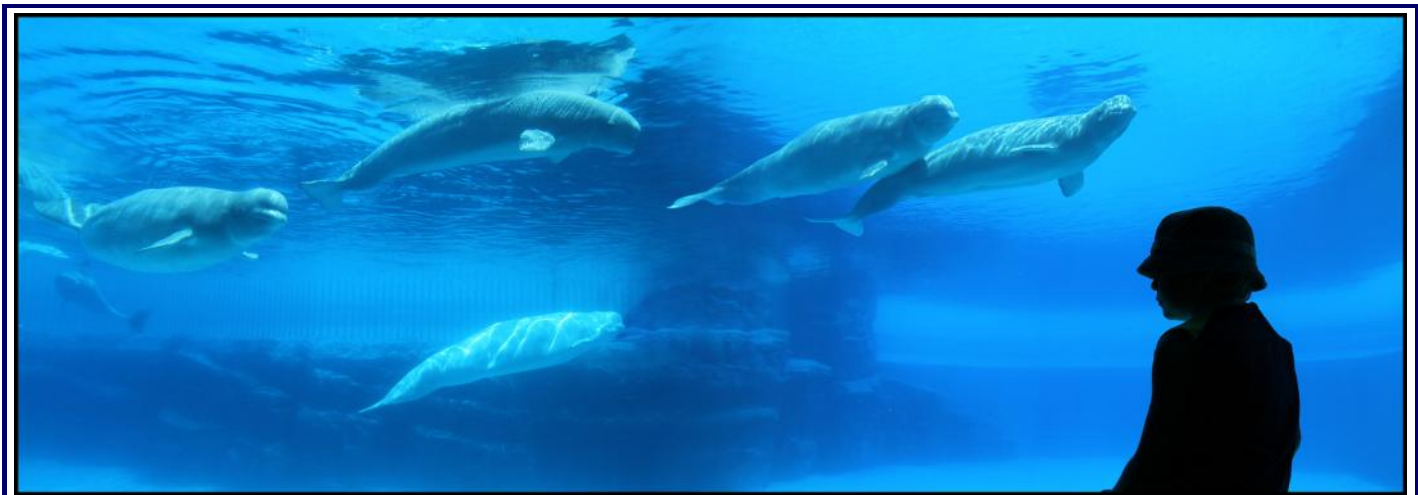
Contemplating Whales by Paul Sparrow