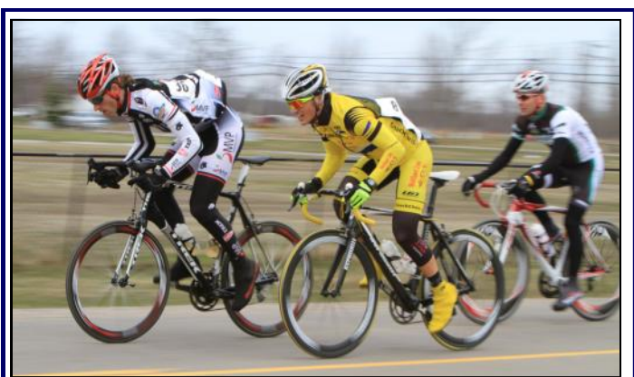
Bike racers

Among the other attractions are a trade show, CAPA Exhibition, field trips, barbeque, awards banquet and fireworks to photograph on Canada Day.