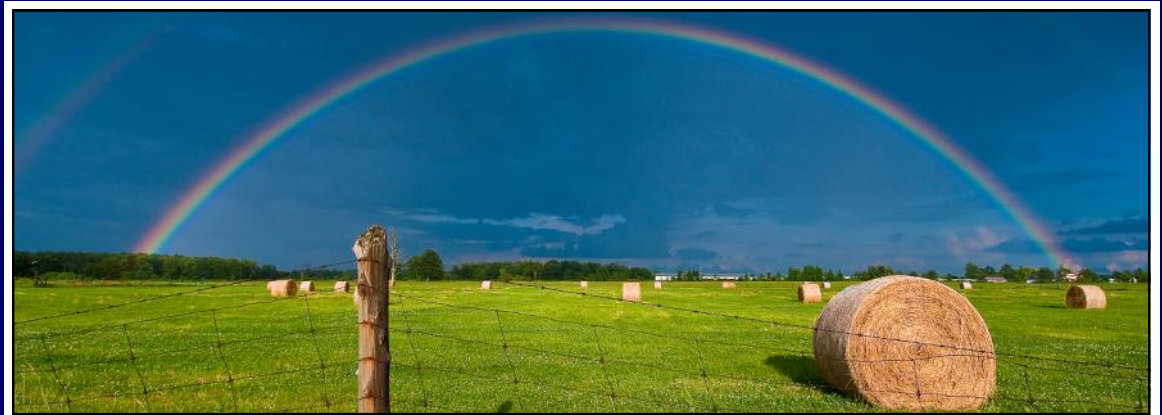
Those who attended the 2010 Latow AV Festival will remember this great image from the show Vision . The Vision images were by various Latow members; this one is Tim Storey's.

The only stipulation for this year's event, other than that the images must be framed, is that you will be required to volunteer to man (or should that be person) the studio for part of the event.