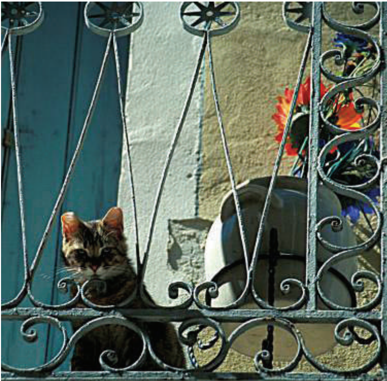
French cat was taken during a stroll through old Montpellier in Southern France