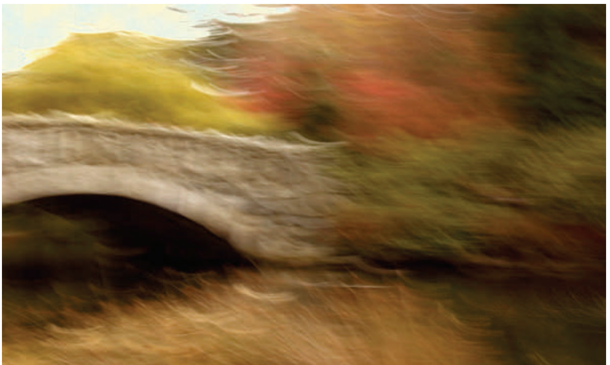
Beacon Hill Park in BC