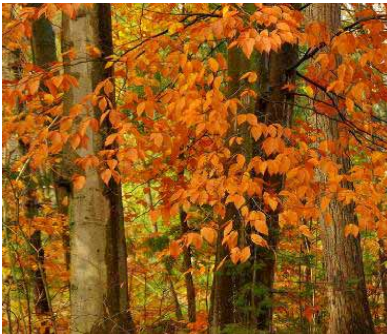
By Bob Walling

Let's start with a any photo. Open this photo in Paint Shop Pro or Photoshop and duplicate it in a second layer by choosing Layers, Duplicate from the menu bar. You won't see a difference in the photo itself, but you should see a second layer appear in the Layer Palette on the right side of the screen. (If the Layer Palette isn't visible, toggle it on by choosing View, Palettes, Layers).