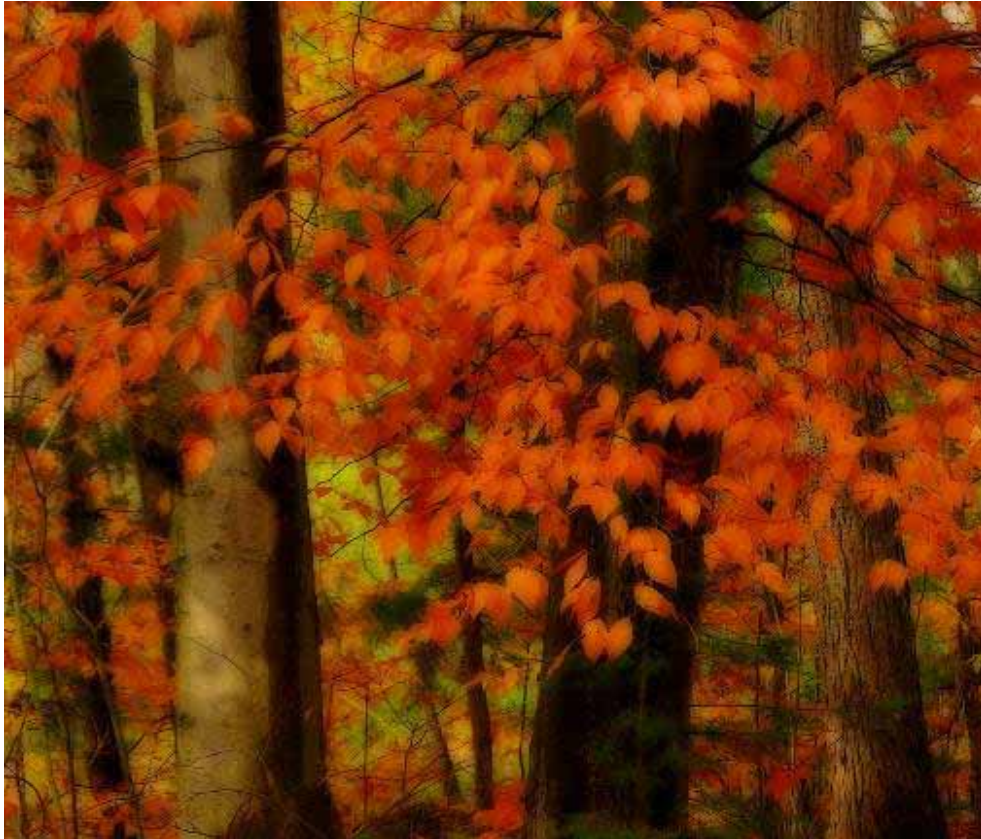
By Bob Walling

The final step? With Blurry still selected, change the blend mode from Normal to Multiply. You should get something like this.