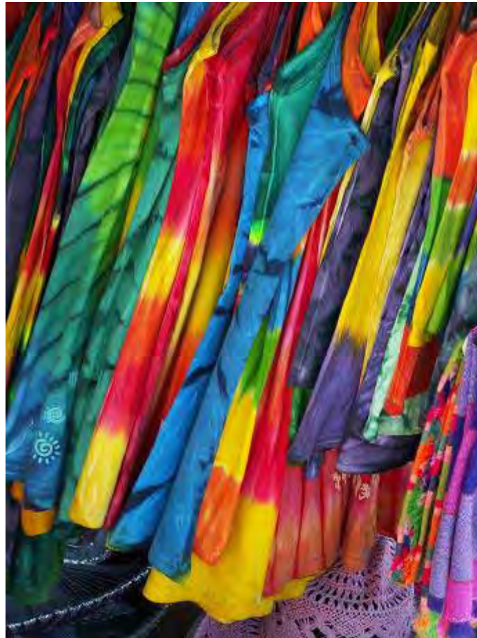
Local colour by Gary Beaudoin