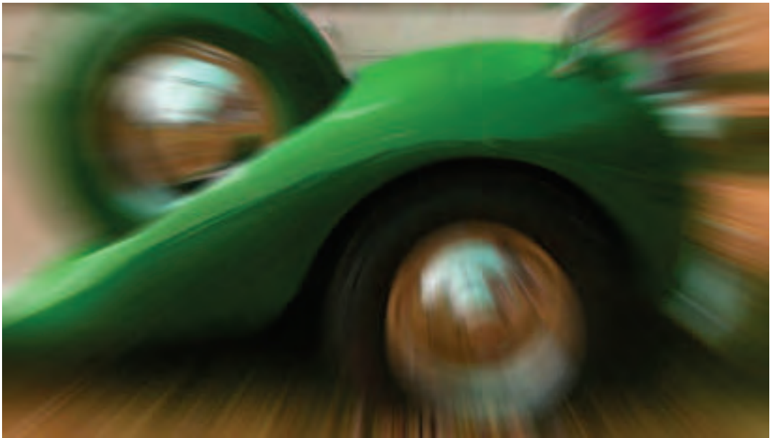
Wheel Blur by Leonie Holmes

and one for blues. All other colours by an intricate process not dissimilar from that in the CCD of digital cameras “invents the colours of our world!