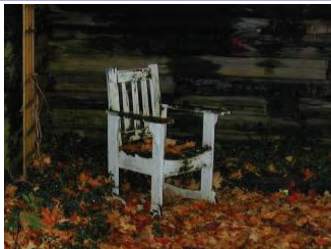
I found a corner to wait for spring.