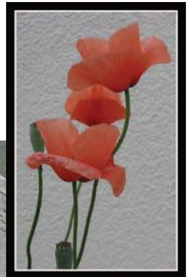
French wild Poppies by George Jurazek