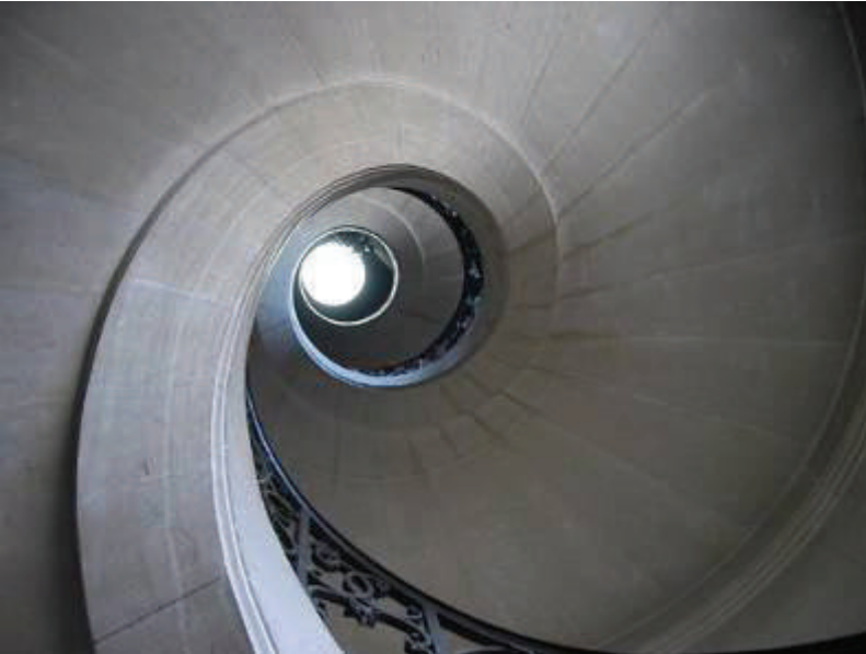
A staircase inside the magnificent Palace Versailles . By looking at the opulence of the Palace and surrounding Gardens it is easy to see how Louis the 14th came close to bankrupting the country. Staircase by George Jurazek

Sights a further distance away, such as Montmartre, the Pere-Lachaise Cemetery and the Palace Versailles were easily reached by train from the subway station.