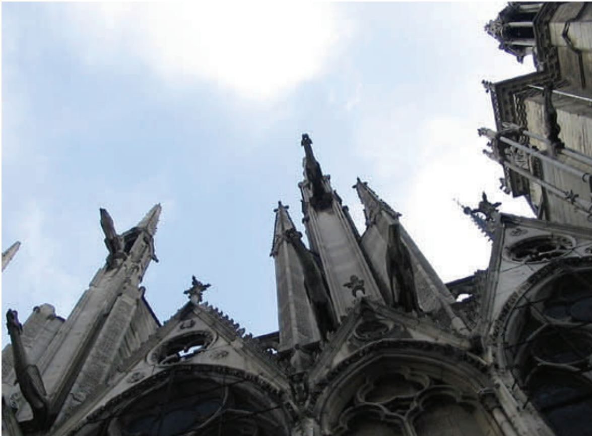
Notre Dame Gargoyles