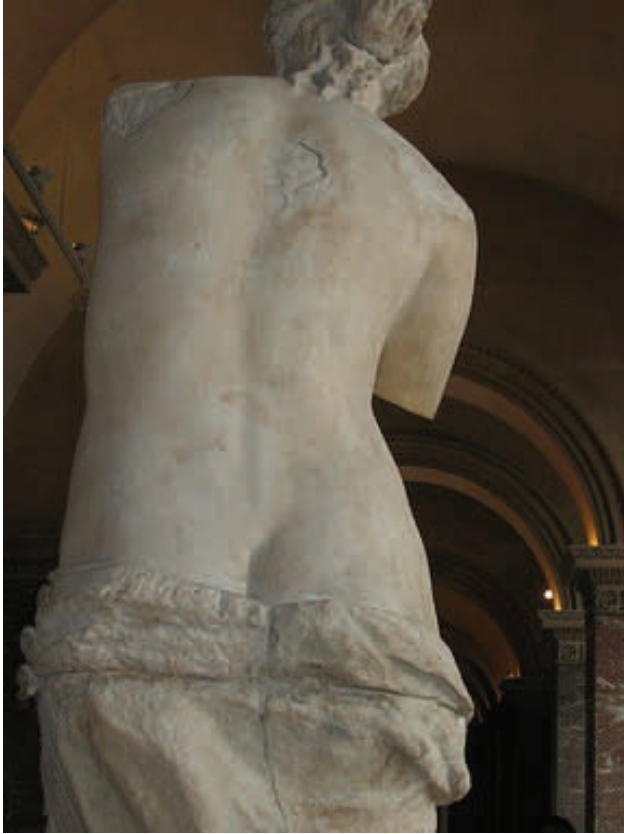
Back side of the Venus de Milo . Thought I would view things from a different perspective. Venus de Milo by George Jurazek

Paris to me it is a city of photographic inspiration and abundant possibilities. The town planners have done a remarkable job of maintaining the architectural character of the city. Nothing seems out of place and nothing distracts from the visual harmony.