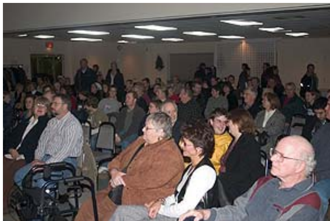
It was Standing Room only for the big night