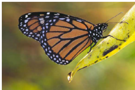
Images created during one of the September 2003 workshops run by Maria Zorn