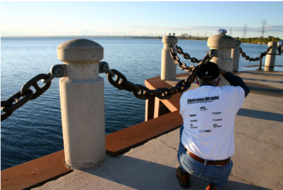
Shooting at Spencer Smith Park