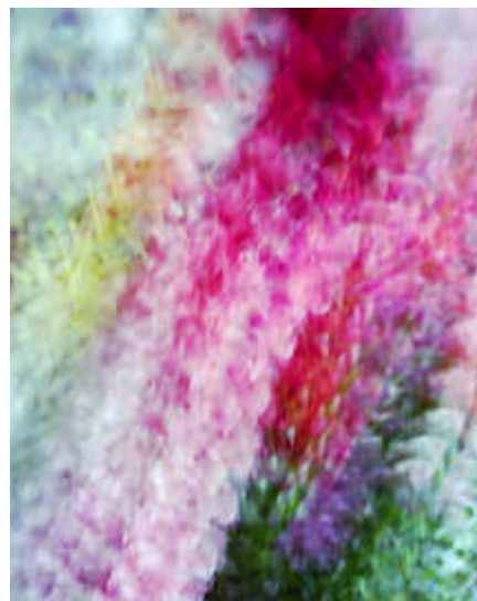
Abstracts of an Orchid and a Vase of Flowers