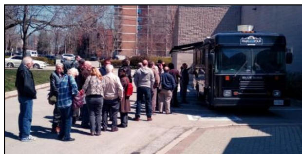
The gourmet food truck was a popular lunchtime option.