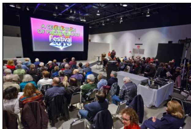
This year’s AV Festival went international, with shows from the United States, Germany and Canada.