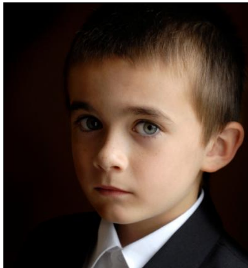
Old Soul by Rolly Astrom

Rolly's image Old Soul was one of 20 pictures picked for publication from over 10,000 images submitted. Old Soul finished third in the Amateur, Humanity category.