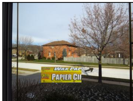
G12 wide angle and zoom (left), compared with Powershot SX50 (right). Both cameras were tripod-mounted and the insert image is full zoom on an object on the street 80 feet away

Conclusion: The PowerShot SX 50 followed me home from Henry's for $399.00.