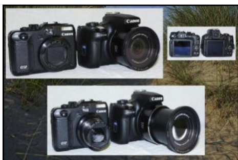
Comparison of size and appearance.